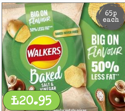
Baked Grab Bag- Salt & Vinegar 32 x 37.5g