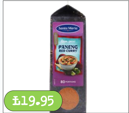
Santa Maria- Penang Red Curry Spice Mix 640g