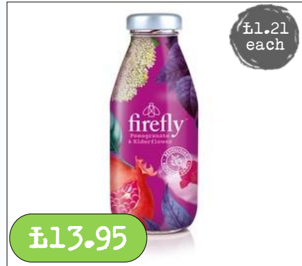
Firefly– Pomegranate & Elderflower Botanical Drink 12x 330ml