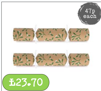
Mistletoe Christmas Cracker FSC Mix 11" x 50