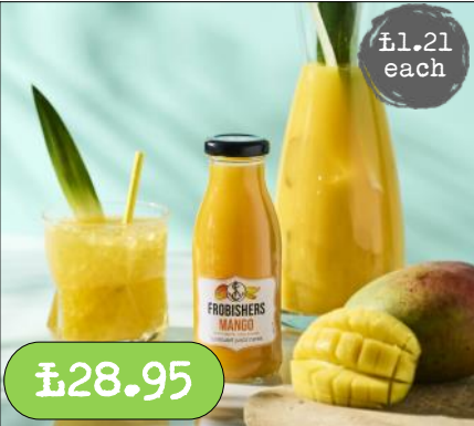
Jubliant Juice- Mango 24 x 250ml