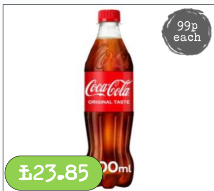
Coca-Cola- 24 x 500ml