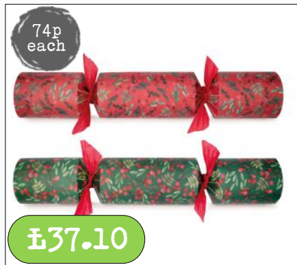
Traditional Foliage Christmas Cracker FSC Mix 12" x 50