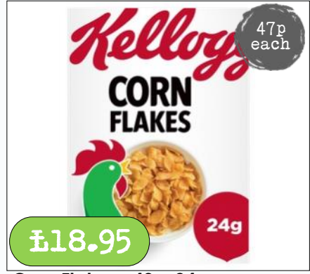
Corn Flakes- 40 x 24g