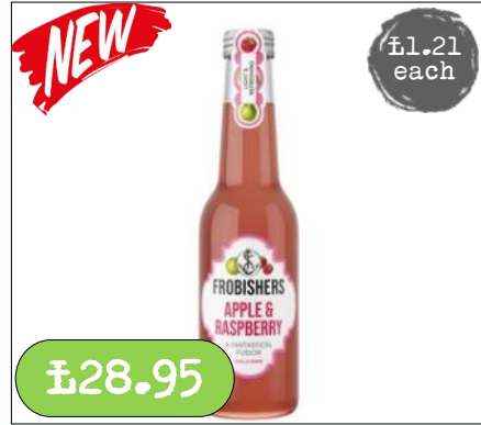
Frobishers Fusion– Apple & Raspberry 24 x 275ml