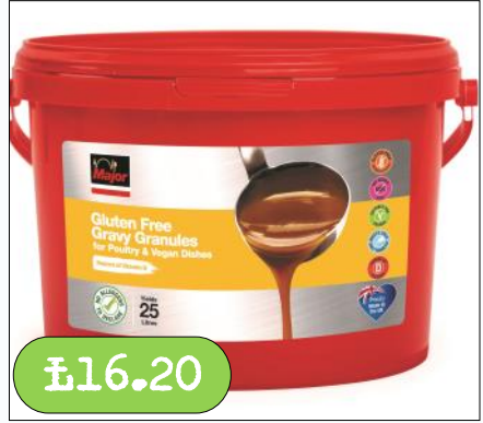
Major-Poultry Gravy Granules GF & Vegan 2Kg