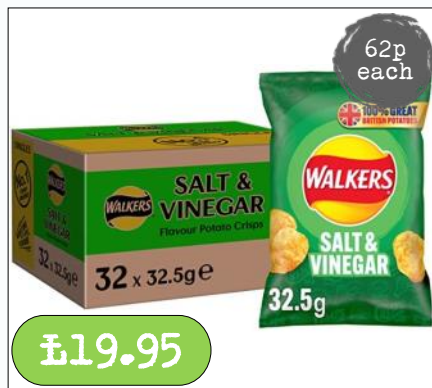
Salt & Vinegar- 32 x 32g