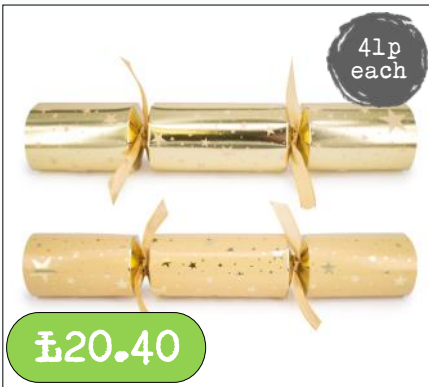
Golden Stars- Christmas Cracker FSC Mix 10" x 50