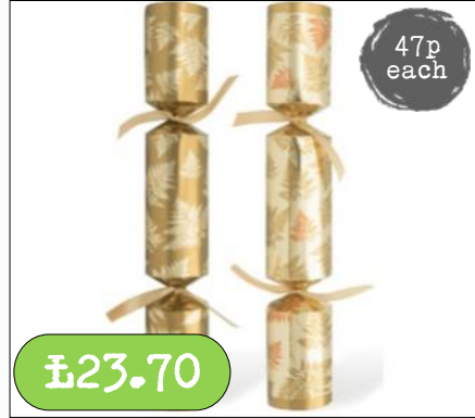
Festive Forest- Christmas Cracker FSC Mix 11" x 50