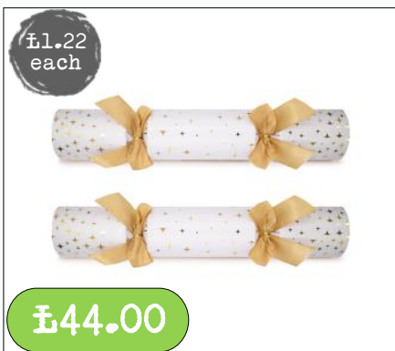
Golden Sky- Christmas Cracker FSC Mix 13" x 36