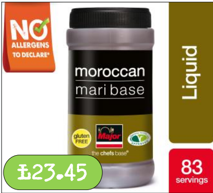
Major- Moroccan Mari Base 1.25Litre