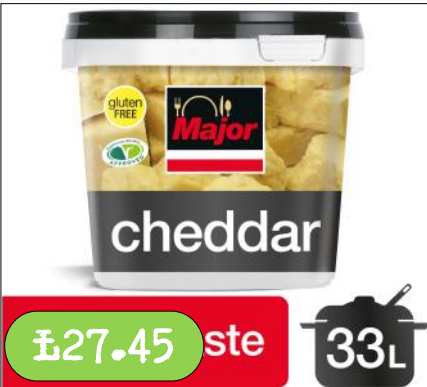
Major- Cheddar Cheese Base Concentrated Paste 1Kg