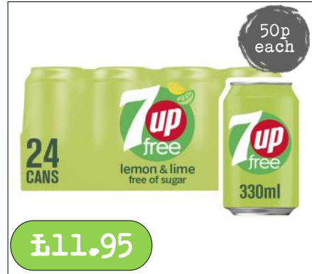
7Up Free- 24 x 330ml