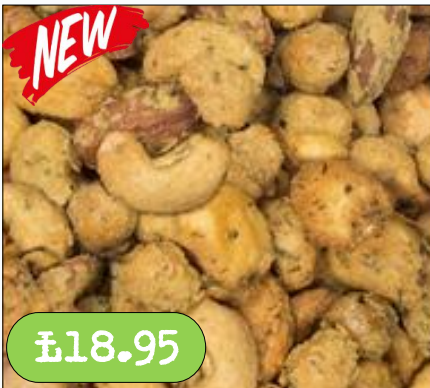
Belazu- Socca Nut Mix 1.1Kg