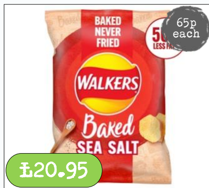
Baked Grab Bag- Sea Salt 32 x 37.5g