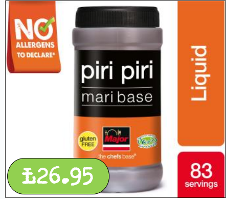
Major- Piri Piri Mari Base 1.25Litre