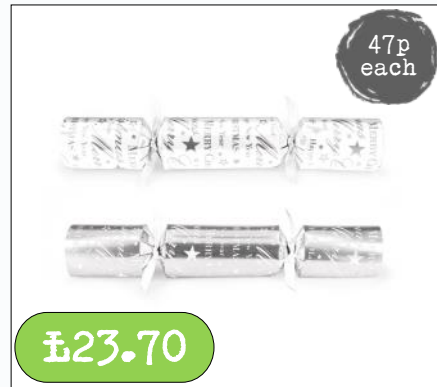
Silver Text- Christmas Cracker FSC Mix 11" x 50