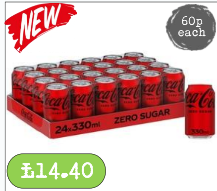
Zero Coke- 24 x 330ml