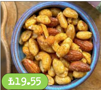
Olives Et Al- Pigs In Blankets Roasted Nuts 1.5Kg