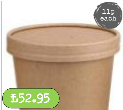
Lid For Soup Bowls- Fits 12-16oz x 500