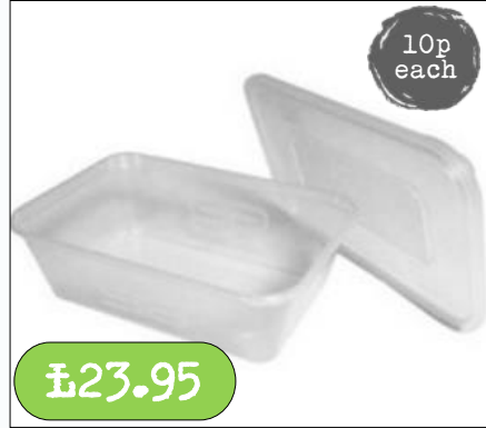
Micro Containers With Lids- 17 x 12cm x 250