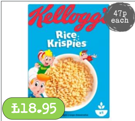
Rice Krispies- 40 x 22g