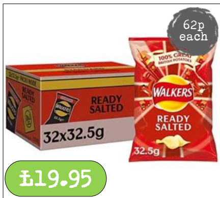
Ready Salted- 32 x 32g