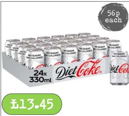
Diet Coke- 24 x 330ml