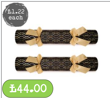
Midnight- Christmas Cracker FSC Mix 13" x 36