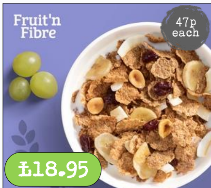
Fruit 'n' Fibre- 40 x 45g