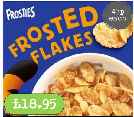
Frosties- 40 x 35g