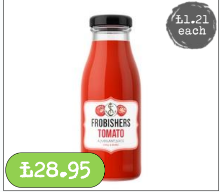
Jubliant Juice- Tomato 24 x 250ml