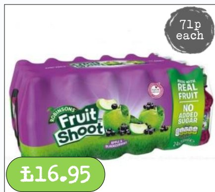
Fruit Shoot- Blackcurrant & Apple Low Sugar 24 x 275ml