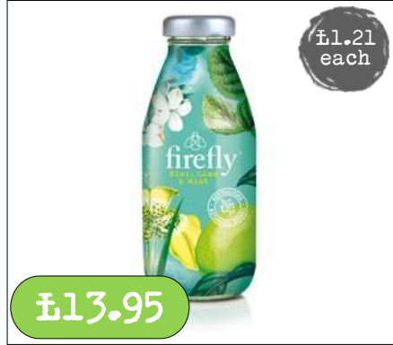
Firefly– Kiwi, Lime & Mint Botanical Drink 12 x 330ml