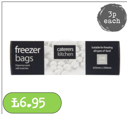
Caterers Kitchen- Freezer Bags 25x25cm x 200