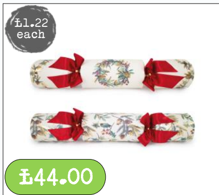
Natural Wreath- Christmas Cracker FSC Mix 13" x 36