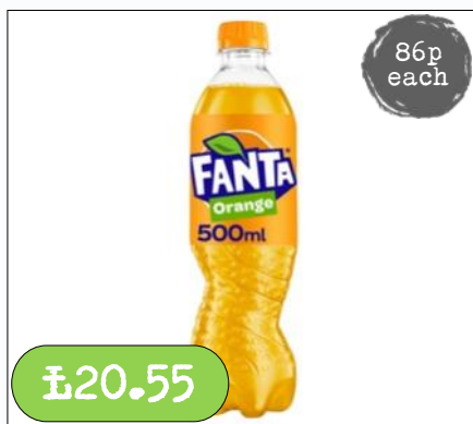
Fanta Orange- 24 x 500ml