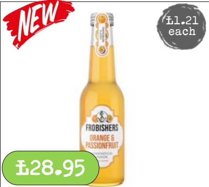
Frobishers Fusion– Orange & Passionfruit 24 x 275ml