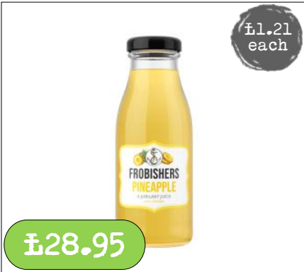
Jubliant Juice- Pineapple 24 x 250ml