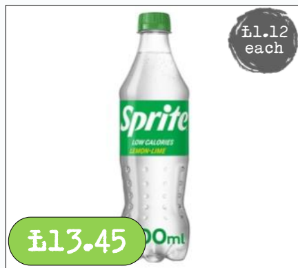
Sprite- 12 x 500ml