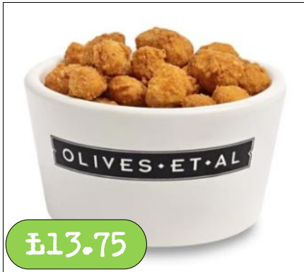
Olives Et Al- Spicy Sesame Peanuts 1.5Kg