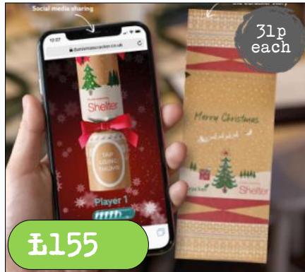
E-Cracker Alternative Christmas Cracker x 500