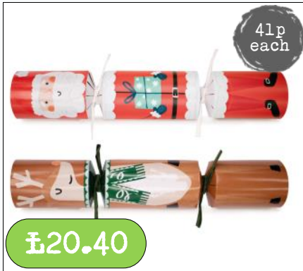
Santa & Reindeer- Christmas Cracker FSC Mix 10" x 50