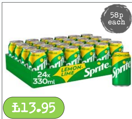
Sprite- 24 x 330ml