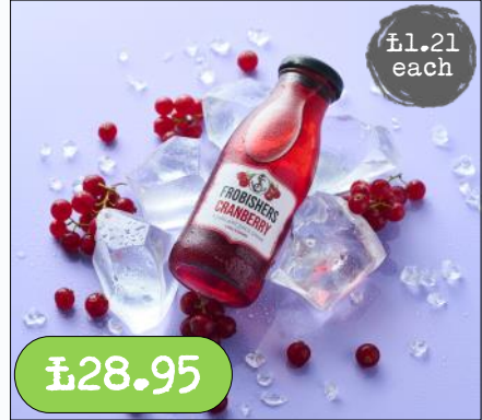
Jubliant Juice- Cranberry 24 x 250ml