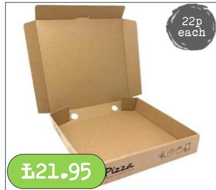
Pizza Boxes- 12 Inch x 100