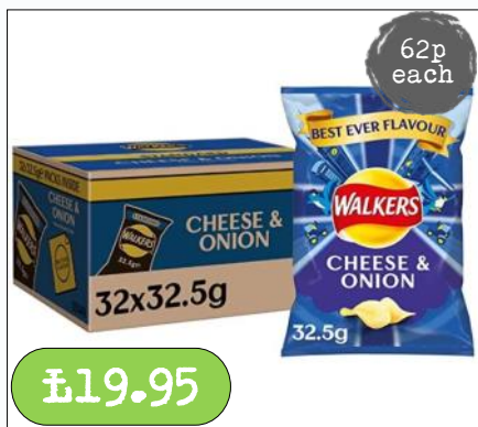
Cheese & Onion- 32 x 32g