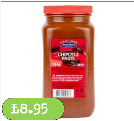
Santa Maria- Chipotle Paste 750g