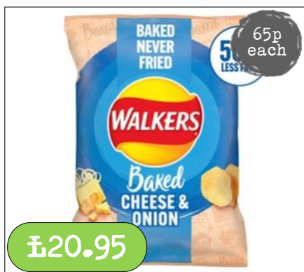
Baked Grab Bag- Cheese & Onion 32 x 37.5g