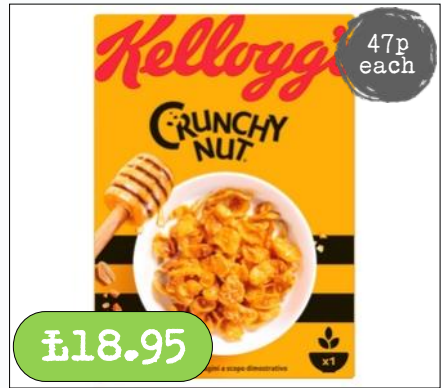
Crunchy Nut- 40 x 35g