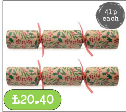
Holly Leaves- Christmas Cracker FSC Mix 10" x 50