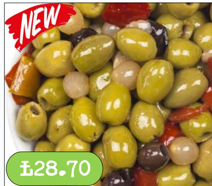
Belazu- Spanish Bar Mix Olives 2.5Kg