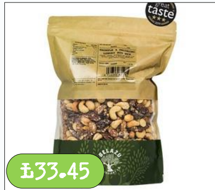
Belazu-Truffle & Pecorino Luxury Nuts 1.35Kg