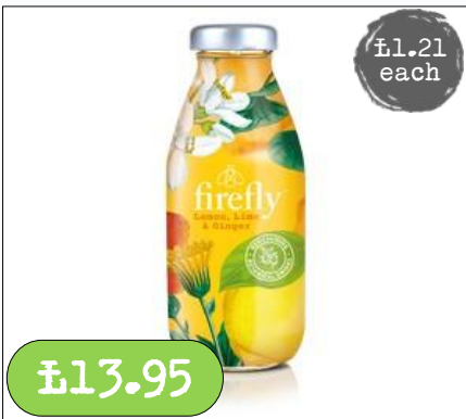
Firefly– Lemon, Lime, Ginger & Botanical Drink 12 x 330ml