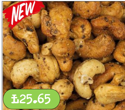
Belazu- Salt & Pepper Cashews 1.2Kg