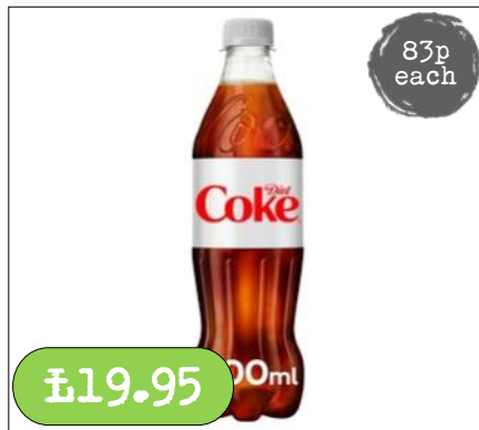
Diet Coke- 24 x 500ml