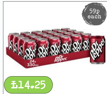
Dr Pepper- 24 x 330ml