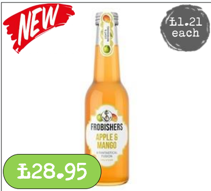
Frobishers Fusion– Apple & Mango 24 x 275ml