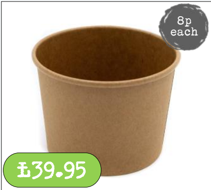
Soup Bowls- 12 oz x 500