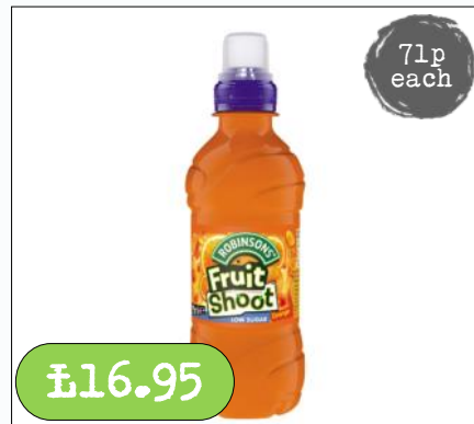
Fruit Shoot- Orange 24 x 275ml