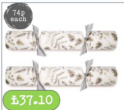
Silver Botanical- Christmas Crackers FSC Mix 12" x 50