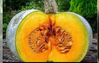
New Forest Crown Prince

Spout Tops are a fantastic winter green that will suit any seasonal menu. Mixed