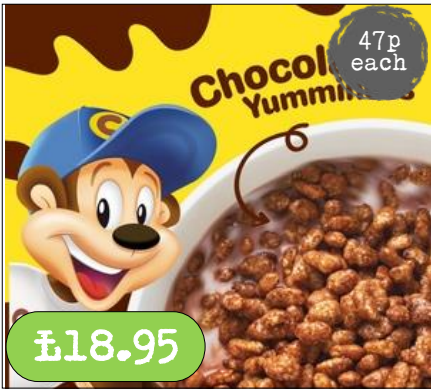
Coco Pops- 40 x 35g