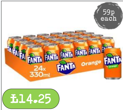
Fanta Orange- 24 x 330ml