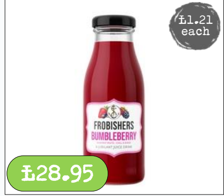
Jubliant Juice- Bumbleberry 24 x 250ml