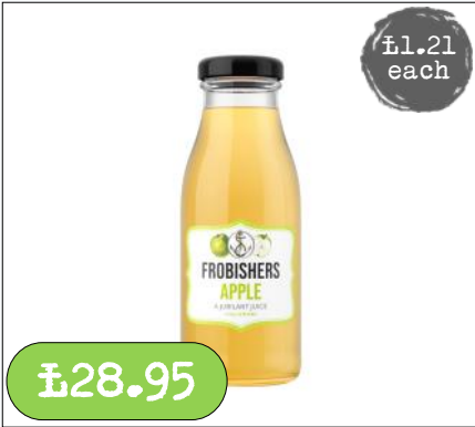
Jubliant Juice- Apple 24 x 250ml