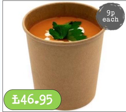
Soup Bowls- 16oz x 500